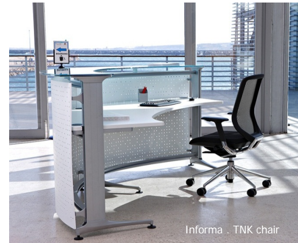
Informa . TNK chair