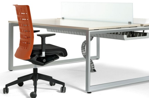
Winner task seating